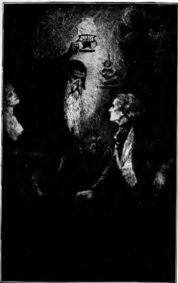
A little old man who turned the light of the lamp upon him